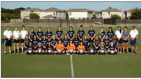
2015 UTSA Roadrunners 1-15-2 overall • 1-8-1 C-USA Coach: Greg Sheen