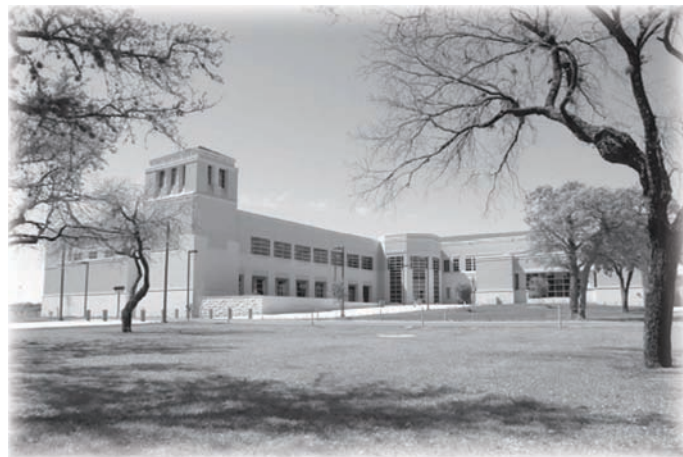
The Student Recreation and Wellness Center.

A new phase of the Recreation and Wellness Center opened in Fall 2007. The $45.7 million project renovated 14,505 square