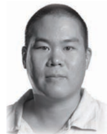
Young Kim Athletics Training Intern