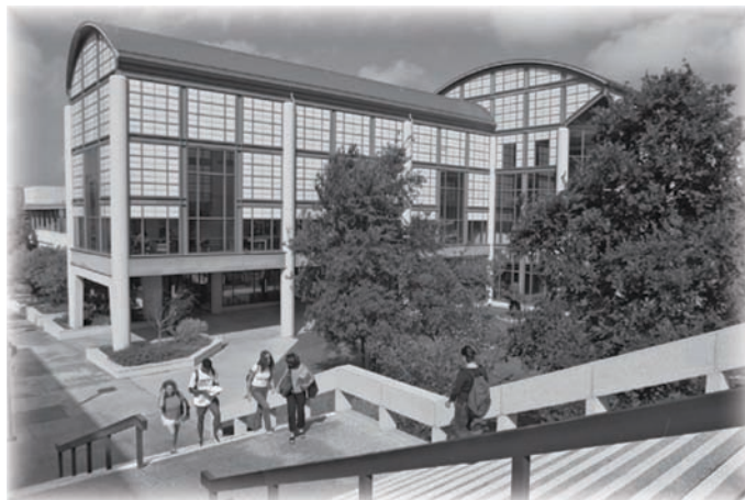
The University Center on the 1604 Campus