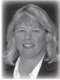
Rae Rippetoe-Blair Women's Basketball