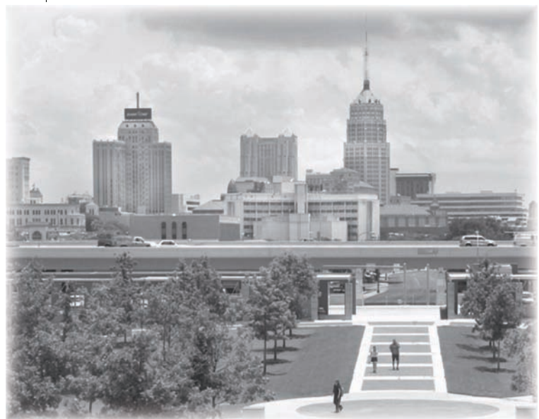
A view of the San Antonio skyline from the Downtown Campus.