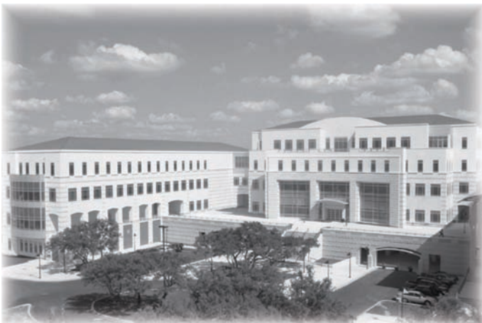
The Main Building on the 1604 Campus