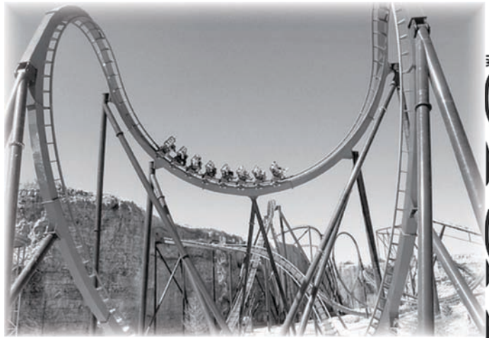
Six Flags Texas features several roller coasters and a water theme park.