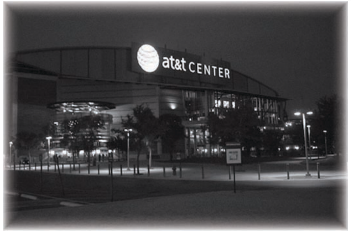
The AT&T Center is the home to the San Antonio Spurs and San Antonio Silver Stars.