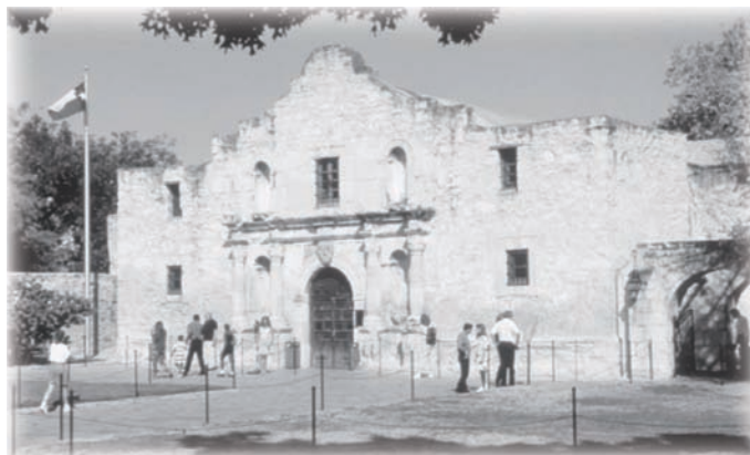
The Alamo is the top tourist attraction in San Antonio and is one of the state's most important historical landmarks.