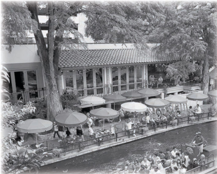
The River Walk is one of San Antonio's main tourist attractions.

The town also boasts popular tourist attractions Six Flags Fiesta Texas and Sea World (the world's largest marine-life theme park). More than 20 million tourists visit the city per year.