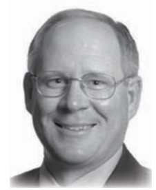
Sherman Corbett Baseball