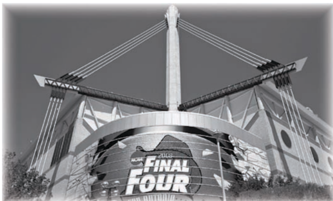
The Alamodome was the site for the 2008 NCAA Men's Final Four and is the future site for the 2010 NCAA Women's Final Four.